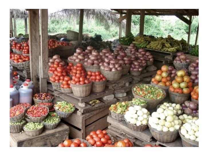
Fig. 3 Raw materials for West African green food products, Ghana

The GreenGrowth project, has with its West African and Danish partners, its infrastructure, project management and excellent productive collaboration among all partners, been very effective in meeting the objectives defined and agreed upon. It has been demonstrated for the selected food value chains that traditional fermented West African food can be a driver of sustainable food production, by introducing green processing methods by use of starter cultures, upgrading the entire value chain and implementing new business models for income generation and employment.