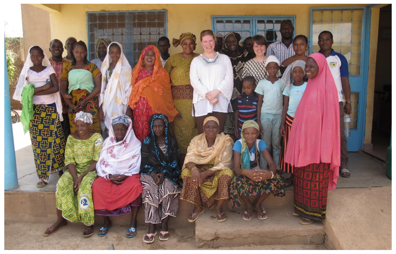
Fig 1. Meeting with women's cooperatives, Fada-Ngourma, Burkina Faso, 2015