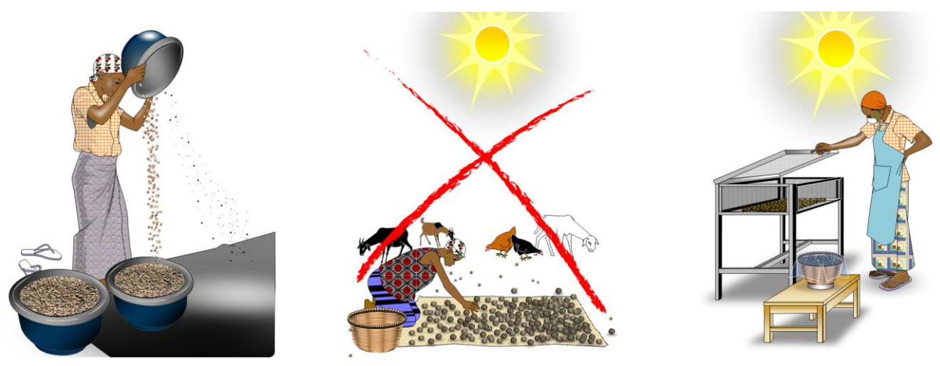
Fig. 2 Illustrations from pictorial for proper production of fermented food, Burkina Faso

Traditional fermented food products have held a vital position in the West African diet for several centuries. Preserving these traditional foods is therefore vital for meeting the nutritional needs of all ages of the population, as well as for ensuring food security, alleviating poverty, developing local businesses, providing job creation and implementing green processing strategies. As the traditional food culture and diets