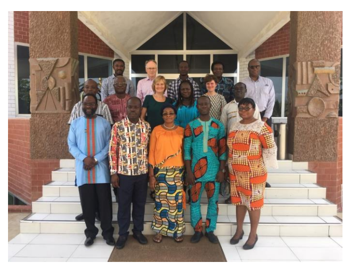
Fig. 5 GreenGrowth consortium meeting, Cotonou, Benin, 2018