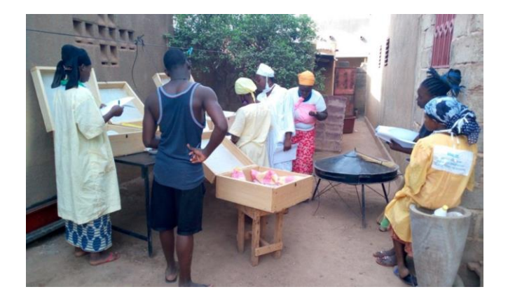
Fig. 4 Sensorial evaluation of fermented food made by starter cultures at SME level, Ouagadougou, Burkina Faso, 2017

A sustainable laboratory infrastructure and internationally accepted procedures were established for preserving the West African biodiversity of potential starter cultures in three national culture collections in Ghana, Burkina Faso and Benin managed by the African partners in an open collaboration with fully shared responsibility and ownership. As a consequence, interest was raised in the SMEs for using starter cultures and to implement food safety and quality management. Additionally, the project pointed out the need for further work to develop bio-degradable packing for fermented food.